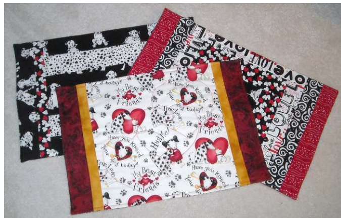
Orphan Block Kennel Quilt 12" x 18"